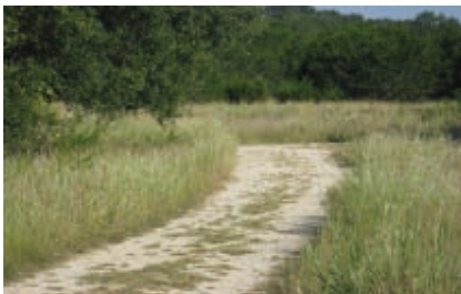
The Path to Forgiveness

On a Friday morning, eleven residents, each selected especially for their essays describing the gifts they hoped to share with the group and their expectations of the weekend, set off to the U Bar U Retreat and Conference Center near Kerrville.