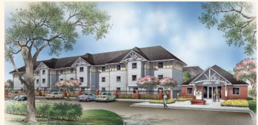
Architectural rendering of A Place of Her Own

The mission of The Women's Home is to help women in crisis regain their self-esteem and dignity, empowering them to return to society as productive, self-sufficient individuals.