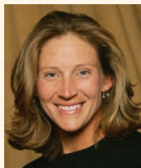
Angela Stanford LPGA Player