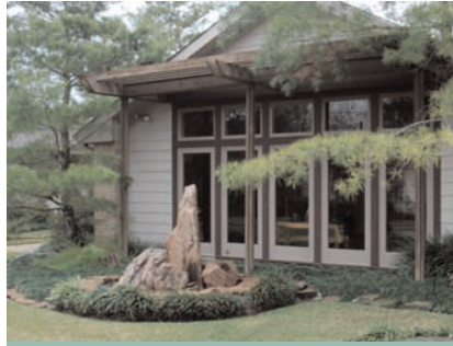
The Chapel and Fountain

"I walked into The Women's Home and I knew at once my spirit was made whole. I felt hope and was embraced with unconditional love. I see myself accomplishing my goals, my weaknesses becoming my strengths. Every day I thank my higher power for the grace of allowing me another chance at life. The Women's Home can only give me the tools. It is left up to me to put them in the right toolbox."