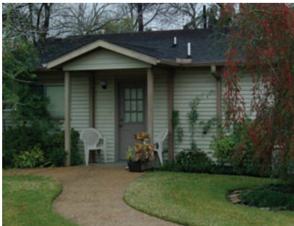
After the Dormitory: Transitional Cottages

The freedom from fear that this new environment offers is the first step toward a new life, the portal to change.