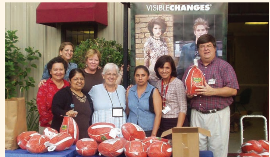
Residents with Treasure Forest Elementary Teachers and Parent Volunteers