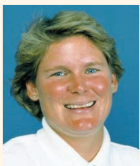
Amy Read LPGA Player